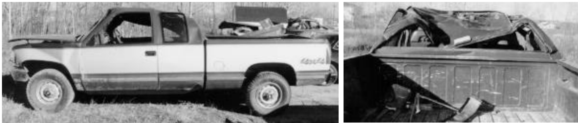
Figure 6: Roof Crush: 1997 Chevrolet Pickup

The 1993 Chevrolet pickup depicted in Figure 6 sustained excessive roof crush, particularly in the area over the rear bench seat. The case illustrates the long structural span that is often required of LTV roof systems given the provision of large window openings.