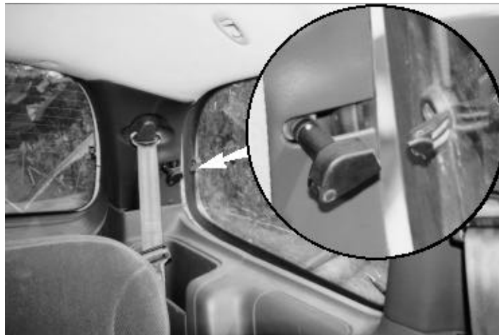
Figure 4: Failure of Side Window Latch

A further type of mounting failure was noted for the rear glazing of two pickups. The rubber mounting gasket that provides the seal between the window frame and the glazing failed during a rollover thereby allowing the glazing to separate from the vehicle completely. The problem is exemplified in case LTVS- 1228 where a 1993 Nissan Kingcab lost its entire rear glazing during a relatively minor rollover.