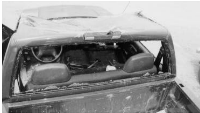
Figure 3: Loss of Rear Glazing