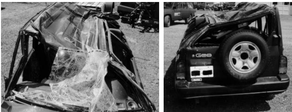
Figure 5: Roof Crush: 1997 Geo Tracker

Figure 5 illustrates two typical cases where the roof crush might be considered excessive given the collision circumstances. The 1997 Geo Tracker depicted in Figure 5, sustained its roof crush during a rollover with an estimated pre-impact speed of only 60-65 km/h. An interesting observation with this case is that the failure pattern of the left side of the roof suggests that the pillars were subjected to a lateral loading. This kind of load, which is common given the dynamics of rollover collisions, is not specifically reflected by the test procedures of CMVSS 216 .