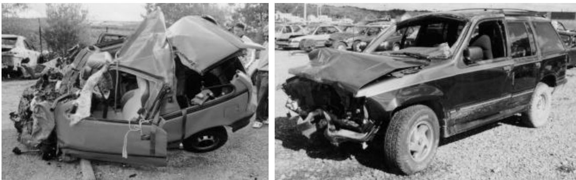
Figure 9: Head-on Impact Damage Between Incompatible Vehicles

Although vehicle size and mass are not likely to be regulated, a standard bumper height and stiffness, mandated through CMVSS 215, Bumpers , for all vehicle classes might prove beneficial. While the standard does govern the height of bumpers (between 400 and 500 mm) it currently only applies to passenger cars and not the multipurpose vehicle or truck classes.