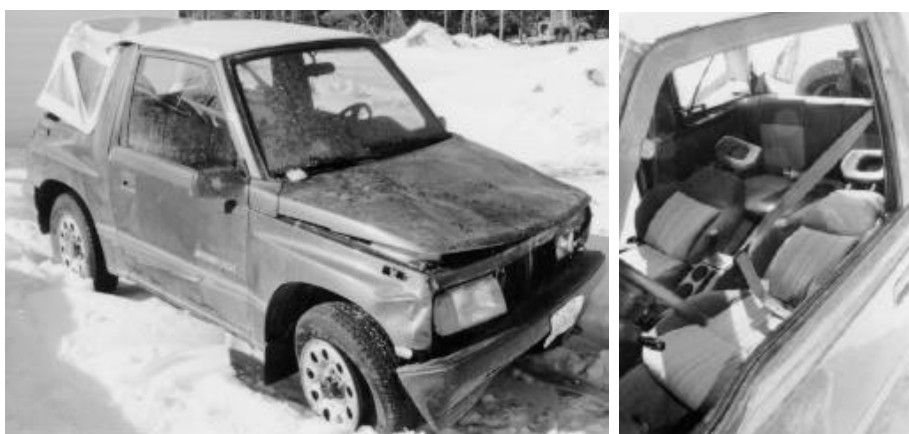
Figure 10: Seatback Failure

CMVSS 207, Seat Anchorages , dictates the static strength that a seat's anchorages and the seatback's self-locking hinge must withstand. The same standard that applies to passenger cars is set out for classes of LTVs. While it is unlikely that occurrences of seatback failures are any more prevalent in LTVs than passenger cars, the consequences may, on average, be more severe given the demonstrated frequent loss of occupant compartment integrity due to side and rear glazing.