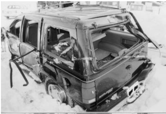
Figure 2: Loss of Side/Rear Glazing