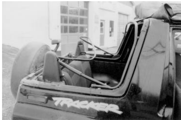
Figure 7: Lack of Protective Roof Structure

Figure 7 exemplifies a class of vehicles (convertibles) for which CMVSS 216 does not apply. The 1995 Geo Tracker (soft-top) depicted was involved in a low speed rollover collision. Had there been any occupants in the rear seat, they would have been completely exposed given that there was no protective roof structure present. It is ironic to note the provision of mounting structures for the D-rings of three-point restraints for the outboard passengers, in the absence of any protective roof structure.