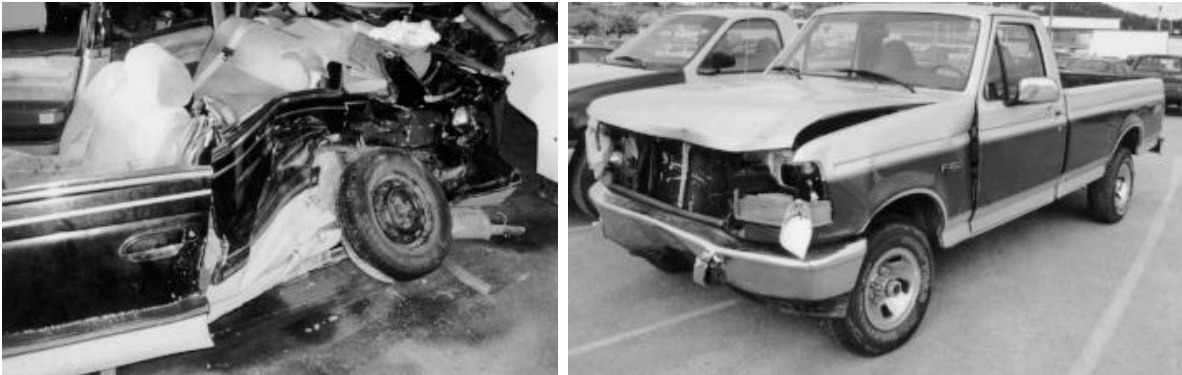
Figure 8: T-type Impact Damage Between Incompatible Vehicles

Figure 9 depicts an example of a frontal collision between incompatible vehicles. The 1989 Pontiac Firefly and the 1993 Ford Explorer impacted in a head-on configuration. The Explorer overrode the front end of the Firefly because of its additional height and chassis stiffness. Note that the mass of the Explorer was nearly 2.6 times that of the Firefly.