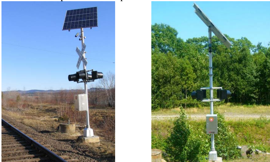
Figure 4: Radar-based warning system (Left – initial installation; Right – testing in passive mode)

The project employed an active warning system prototype cosmetically similar to the system employed for the Minnesota low-cost warning system (Figure 4). The major differences for this project were that train detection was by a radar unit located on the warning system, there was no communication between the train and warning system, and only one crossing prototype was tested rather than a series of active systems. This was likely due to the need to prove the concept of radar-based train detection.