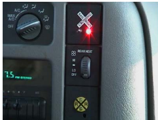
Figure 3: In-vehicle warning of upcoming train

The system antennas were built into the crossbucks and vehicle license plate. The train employed an internal head-of-train (HOT) radio frequency which was detected by equipment located in 30 school busses to determine train proximity. The in-vehicle system was tested from December 1997 to May 1998 and the passive train detection system in June 1998.