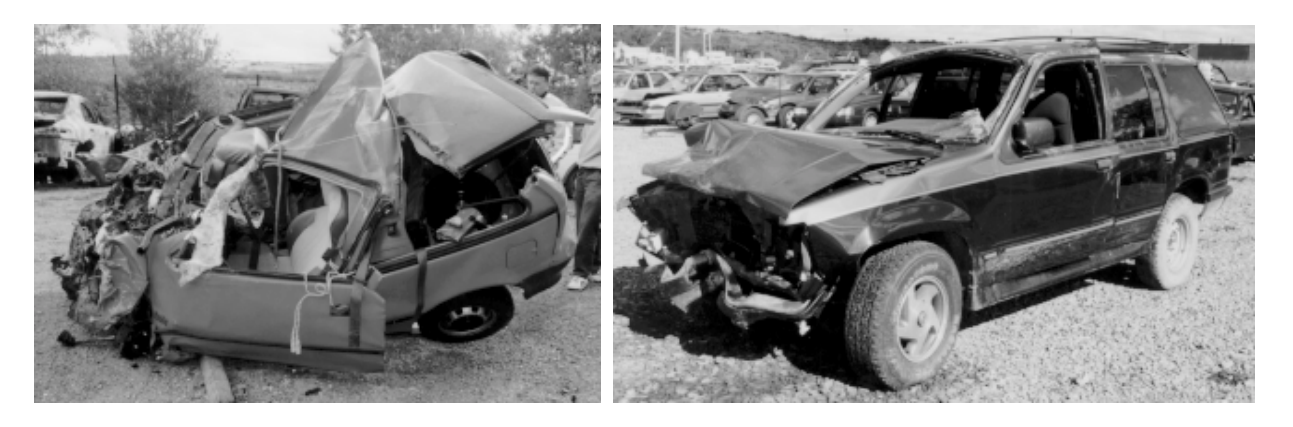
Figure 9: Head-on Impact Damage Between Incompatible Vehicles

Although vehicle size and mass are not likely to be regulated, a standard bumper height and stiffness, mandated through CMVSS 215, Bumpers, for all vehicle classes might prove beneficial. While the standard does govern the height of bumpers (between 400 and 500 mm) it currently only applies to passenger cars and not the multipurpose vehicle or truck classes.