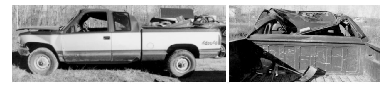
Figure 6: Roof Crush: 1997 Chevrolet Pickup

The 1993 Chevrolet pickup depicted in Figure 6 sustained excessive roof crush, particularly in the area over the rear bench seat. The case illustrates the long structural span that is often required of LTV roof systems given the provision of large window openings.