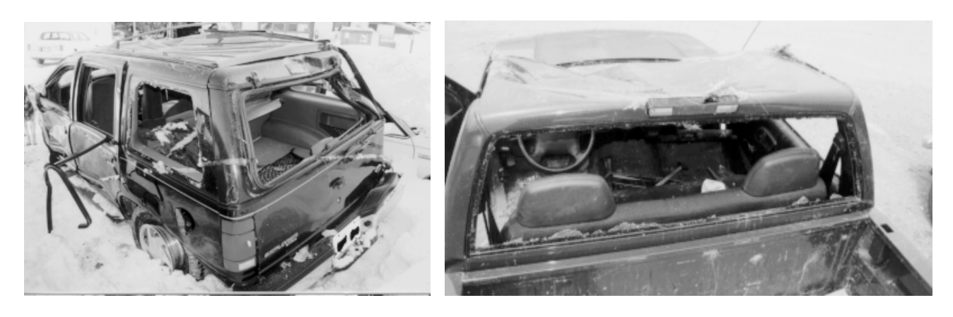
Figure 2: Loss of Side/Rear Glazing