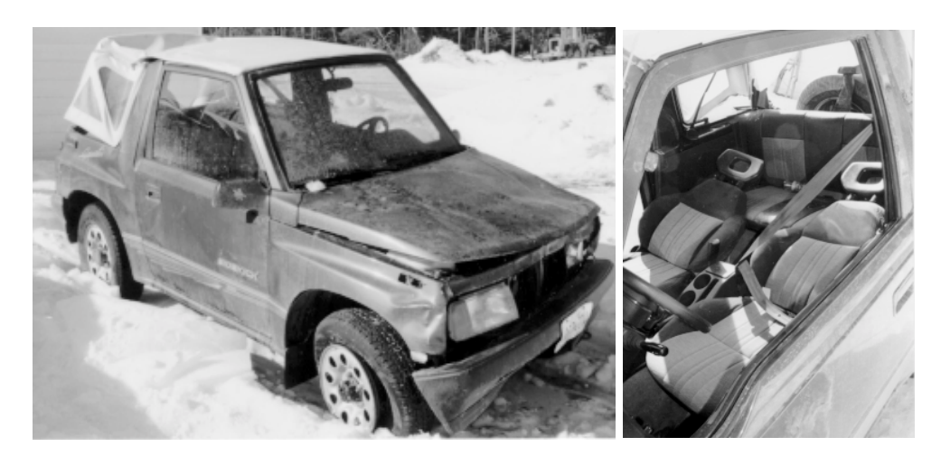
Figure 10: Seatback Failure

CMVSS 207, Seat Anchorages , dictates the static strength that a seat-s anchorages and the seatback-s self-locking hinge must withstand. The same standard that applies to passenger cars is set out for classes of LTVs. While it is unlikely that occurrences of seatback failures are any more prevalent in LTVs than passenger cars, the consequences may, on average, be more severe given the demonstrated frequent loss of occupant compartment integrity due to side and rear glazing.