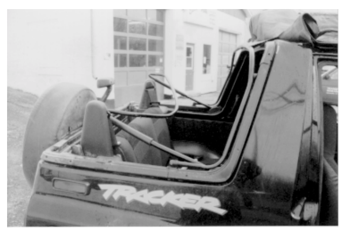
Figure 7: Lack of Protective Roof Structure

Figure 7 exemplifies a class of vehicles (convertibles) for which CMVSS 216 does not apply. The 1995 Geo Tracker (soft-top) depicted was involved in a low speed rollover collision. Had there been any occupants in the rear seat, they would have been completely exposed given that there was no protective roof structure present. It is ironic to note the provision of mounting structures for the D-rings of three-point restraints for the outboard passengers, in the absence of any protective roof structure.