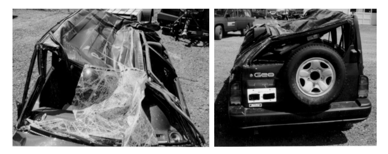
Figure 5: Roof Crush: 1997 Geo Tracker

The 1993 Chevrolet pickup depicted in Figure 6 sustained excessive roof crush, particularly in the area over the rear bench seat. The case illustrates the long structural span that is often required of LTV roof systems given the provision of large window openings.