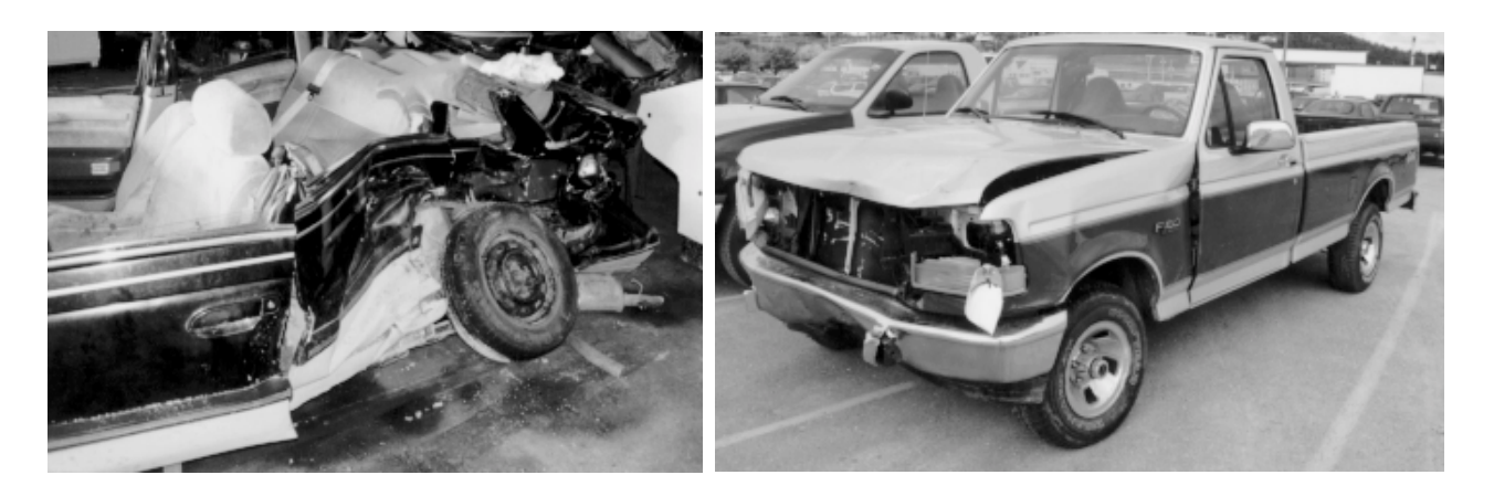
Figure 8: T-type Impact Damage Between Incompatible Vehicles

Figure 9 depicts an example of a frontal collision between incompatible vehicles. The 1989 Pontiac Firefly and the 1993 Ford Explorer impacted in a head-on configuration. The Explorer overrode the front end of the Firefly because of its additional height and chassis stiffness. Note that the mass of the Explorer was nearly 2.6 times that of the Firefly.