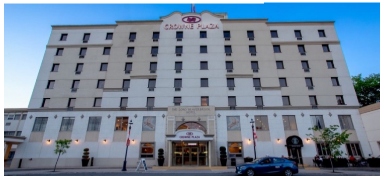
Crowne Plaza Fredericton Lord Beaverbrook

*Please see conference website for discount code