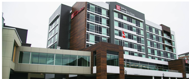
Hilton Garden Inn, Downtown Fredericton