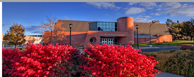
Wu Conference Centre, UNB Fredericton campus

The Wu Conference Centre on UNB's Fredericton campus is a full-service meeting facility offering 12,500 square feet of professional meeting space.