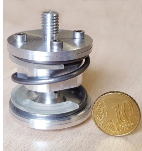
Fig. 3 The wrist prototype developed.

This paper presents the concept of a novel of passive wrist with automatically selectable stiffness. The developed prototype (Fig. 3) weighs only 80 g and its dimensions (diameter = 38 mm, length = 42mm) making the wrist suitable for transradial prostheses at every level of amputation.