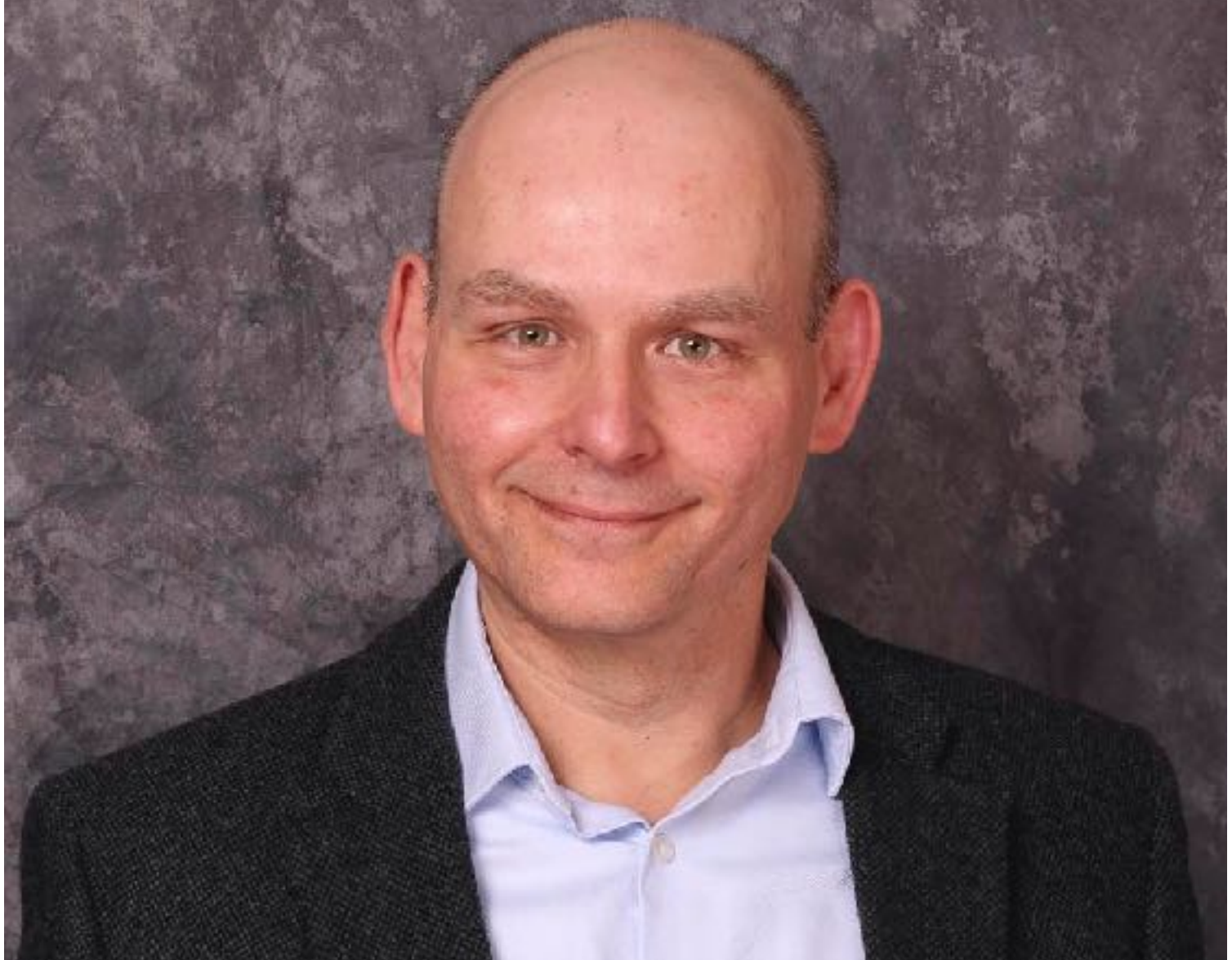
Program Director, River Valley Strategy, McCain Foods Canada.