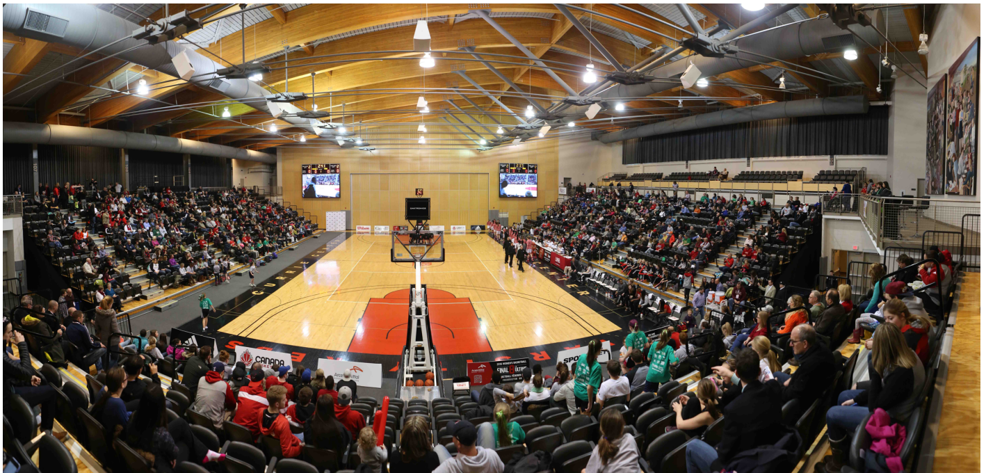
Performance Gym - Varsity Basketball