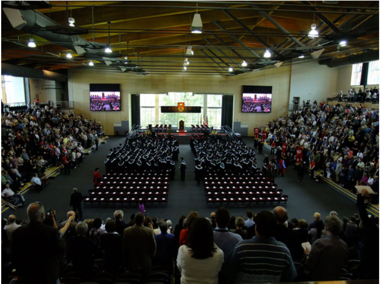
UNB Graduation - May 2011