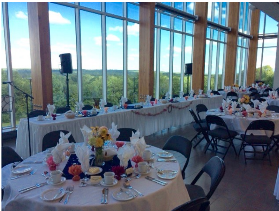
Long Hall Setup for Wedding Reception

The Long Hall is an open reception space on the fourth level adjacent to the Performance Hall that can be used for receptions, dinners and other functions. It measures 125 feet x 21 feet and offers a wonderful view of the city and the St. John River valley with its floor to ceiling windows. It can be configured for a dinner for 160 or a stand-up reception for 300.