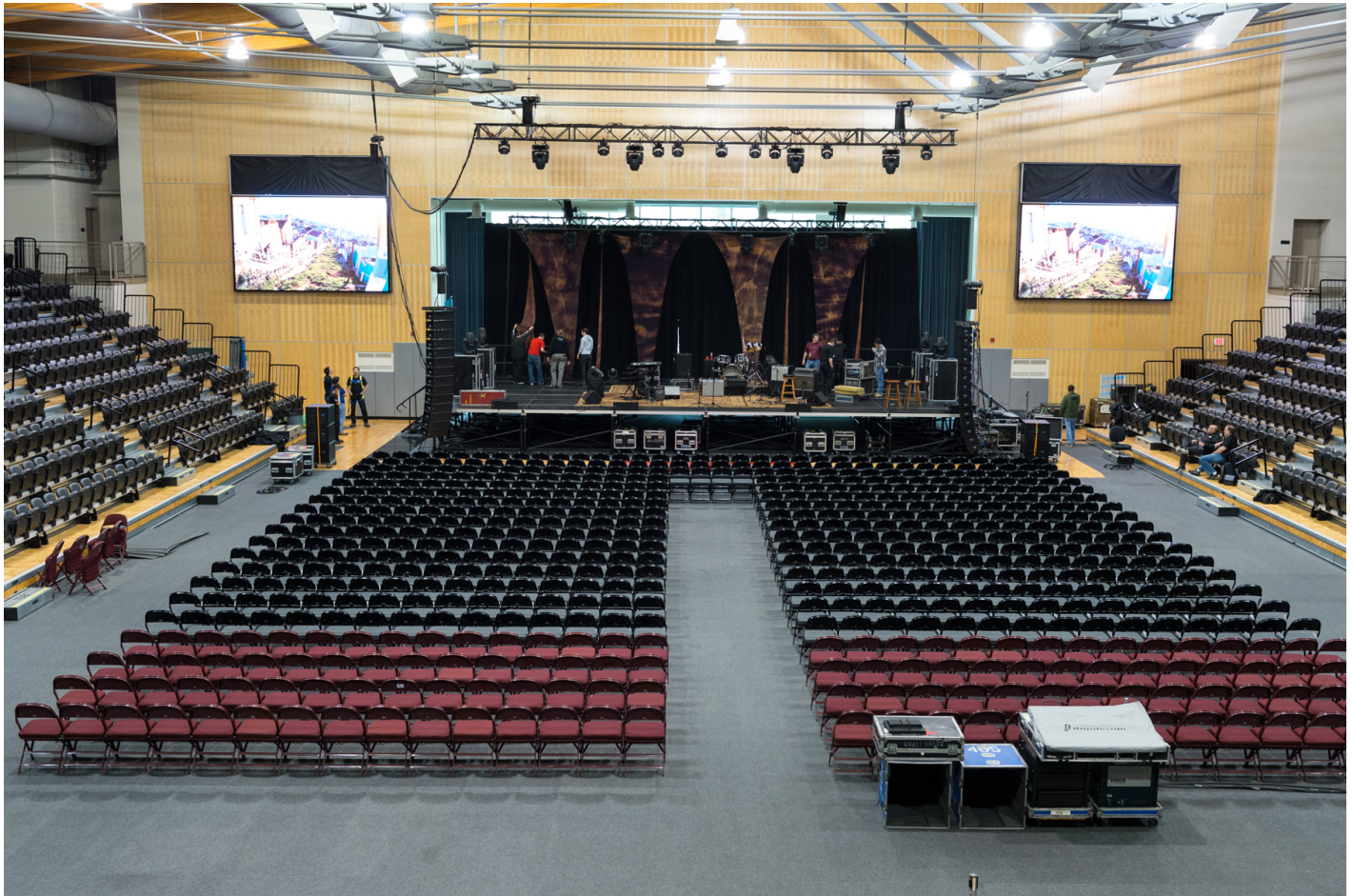
CONCERT STAGE SETUP (48 FT W X 32 FT D X 4 FT H) WITH FLOOR SEATING

We have a StageRight portable stage. The stage is modular in 4 foot x 8 foot sections and can be configured in any size up to a maximum 60 feet x 40 feet with up to three stairs, guardrails and one or two ADA wheelchair ramps. The standard stage height is 36 inches but the height is adjustable from 36 to 54 inches. The stage decks are reversible with black TechStage and black carpet surfaces. Use of the ADA wheelchair ramps require a stage height of 36 inches.