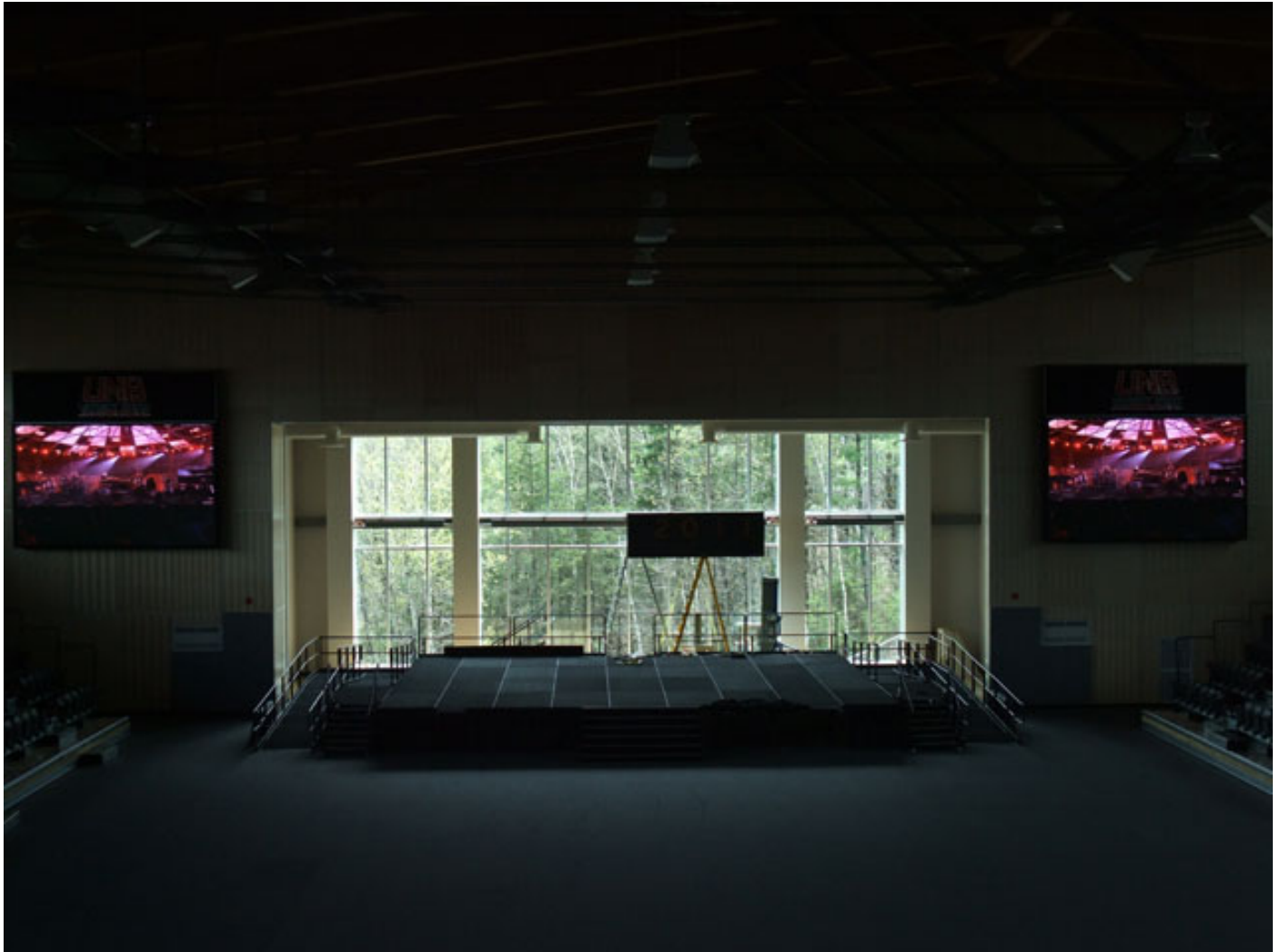
STAGE SETUP WITH RAMPS FOR GRADUATION CEREMONIES