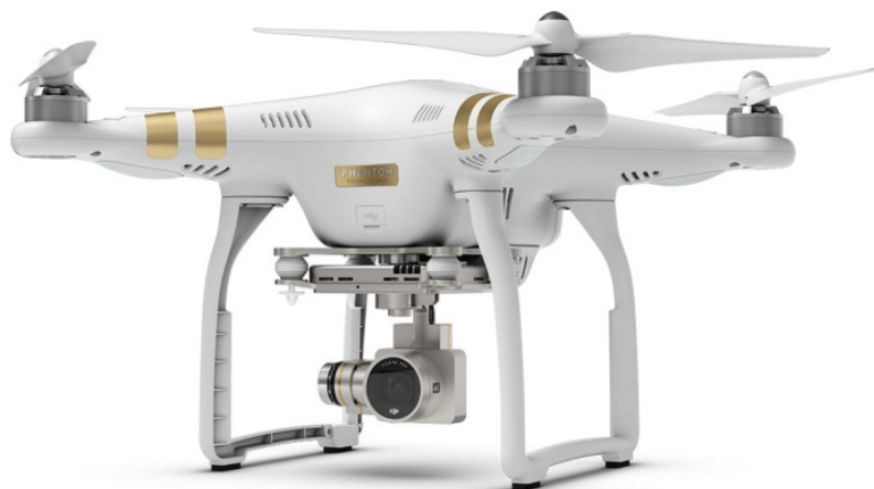
Figure 1 - DJI Phantom 3 Professional [ www.bhphotovideo.com ]

Data collection for the Route 8/Smythe Street roundabout began in September 2015 and continued to September 2016, resulting in the accumulation of a full year of data. An unmanned aerial vehicle model DJI Phantom 3 Professional (Figure 1) was flown for a one-hour period monthly.