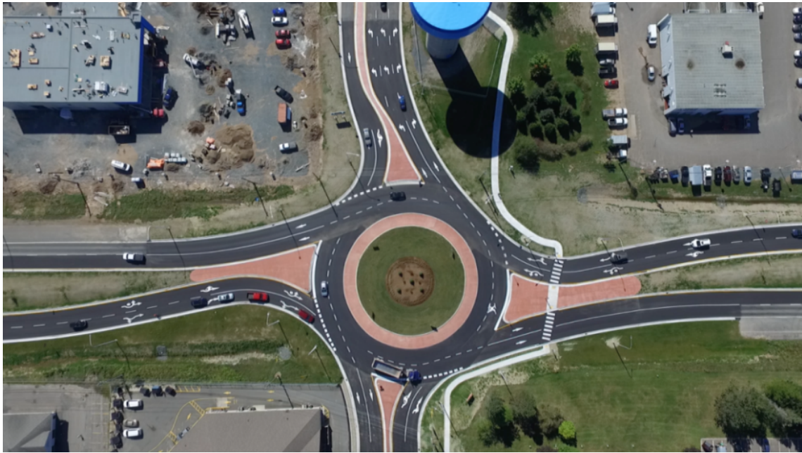
Figure 2 - Aerial view of roundabout captured by drone from 150m

The image provides a perfectly centered aerial image (rather than orthogonal) which provides the ability to monitor vehicle off-tracking throughout the roundabout. A typical frame capture is shown in Figure 2.