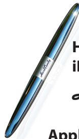
Hard Candy Stylus for iPad – $24.99

Every iPad comes with one year of hardware repair coverage and 90 days of telephone technical support. The AppleCare Protection Plan for iPad extends your coverage to two years from the original purchase date of your iPad.