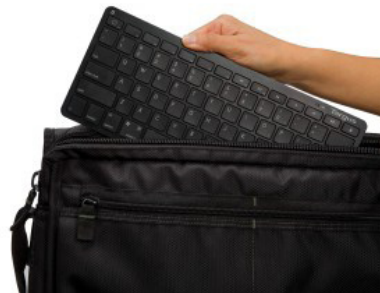
Targus Bluetooth Wireless Keyboard for Tablets – $39.99