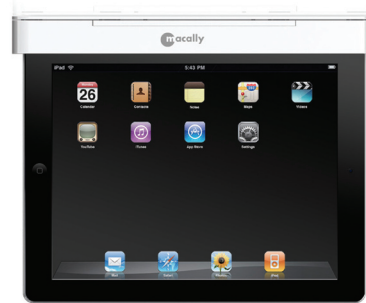
Macally Under Cabinet Mount for iPad 2 – $38.99