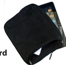
Logiix Micropad Sleeve – $15.99 For tablets up to 10.1"