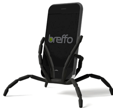
Breffo Spiderpodium Flexible Stand $15.99 for Smartphones, iPods, etc. or $29.99 for tablets