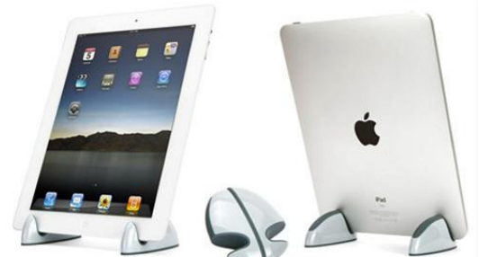
Griffin Arrowhead Universal Stand for Tablets – $16.99