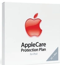
AppleCare Protection Plan for iPad – $79.00

Every iPad comes with one year of hardware repair coverage and 90 days of telephone technical support. The AppleCare Protection Plan for iPad extends your coverage to two years from the original purchase date of your iPad.