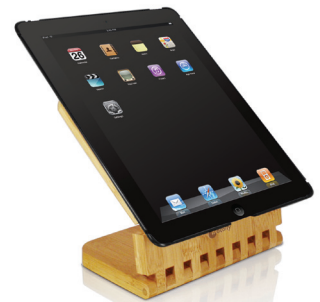
Macally Ecoview Adjustable Bamboo Viewing Stand for iPad 2 – $28.99