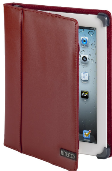
Maroo Designer Leather Case for iPad 2 – $39.99