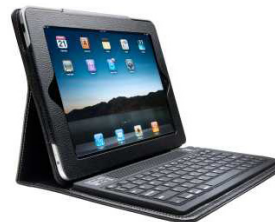
Kensington KeyFolio Bluetooth Keyboard Case $62.99