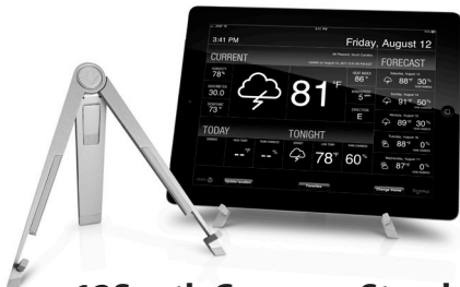
12South Compass Stand $38.99