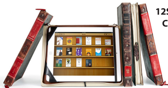
12South BookBook Case for iPad 2 – $64.99